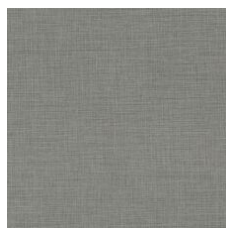
Wind Chime 96530 Weldrod 01225